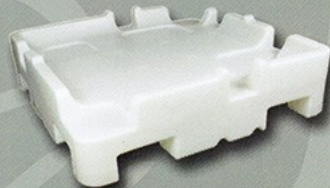
RTT-4444 4-Way Fork Lift Pallet