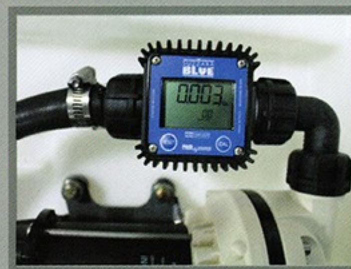
RTT-7030 In-Line Meter